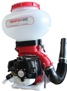
SmarterCast Pro - Broadcast Machine

We import a selection of specialist resin flooring tools for the Australian resin flooring market.