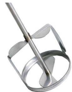
Jiffy - Mix Blade