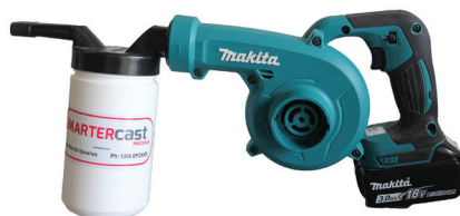
SmarterCast Precision - Broadcast Tool